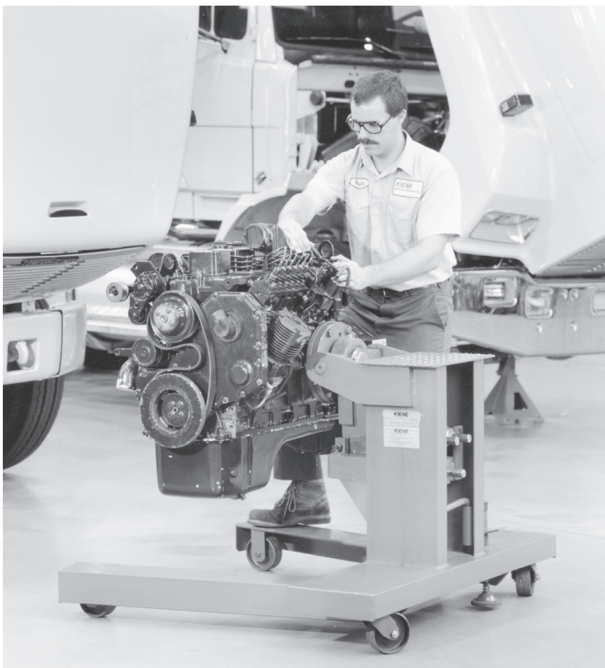
Mobile Model 900

Makes engine rebuilding and servicing easier, faster and safer.